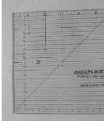
Ruler showing 1/8" markings

When first starting out, I recommend the 6" x 24" or similar ruler as it is the most versatile. It is advisable to purchase one that is in whole inches (eg 5" or 6" rather than 6½") as this makes it easier to work your measurements from either side. It is less confusing and you are less likely to make mistakes.