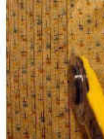
Incorrect (tilted right)

The blade side of the cutter, should be closest to the ruler.