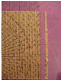
Straighten one edge discarding piece on the right

Always straighten one edge before beginning to cut your pieces. The cut should be at right angles to the fold if any, or the selvage.