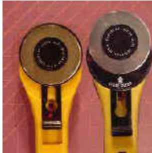
Cutter closed and open