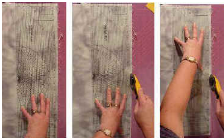
To make long cut, cut just passed support hand, leave cutter in work and reposition hand before finishing cut.

Place hand pressure on the ruler so the ruler does not shift as you roll the cutter along the edge. For long cuts position your supporting hand in the first third of the ruler while you cut along the edge, but only to 2 or 3 inches passed your supporting hand. Leave the cutter in the fabric whole you reposition your supporting hand. Repeat this procedure throughout the entire cut. Note: Be aware of where your fingers and knuckles are positioned, making sure they are not over the ruler's edge where the cut will be made.