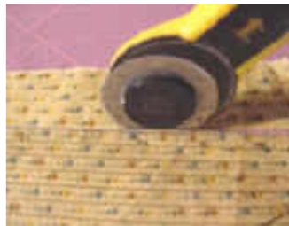
Blade side closest to ruler

The blade side of the cutter, should be closest to the ruler.