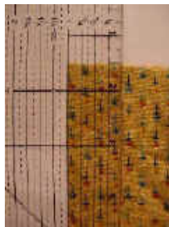
Photo shows correct ruler positioning for a one inch cut strip

To cut strips, the straightened edge should be to the left for right-handed users or to the right for left-handed users. Align the correct ruler mark on the straightened edge, support the ruler with your non-cutting hand, then make the cut.