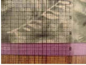
Align guidelines along folded edge

When making a cut on folded fabric, align the ruler's guidelines with the folded edge, not the selvage or raw edges. Place the folded edge closest to you.