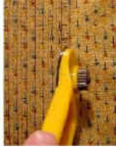
Incorrect (tilted left)